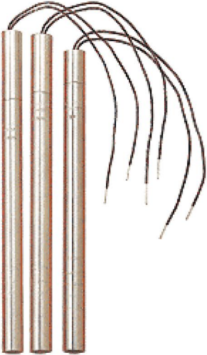
Fig. E - Shown are the same Mighty Watt Cartridge Heaters modified from stock with 3/4", 1-1/4" and 1-3/4" long sheath extension, Fig. E Epoxy seal and Teflon leads.

F igure E provides an epoxy seal to protect Mighty Watt cartridge heaters from the contaminants that cause early failure. Typically supplied with 12" Teflon leads. Specify longer length. Maximum temperature at lead end 300° F/150° C.